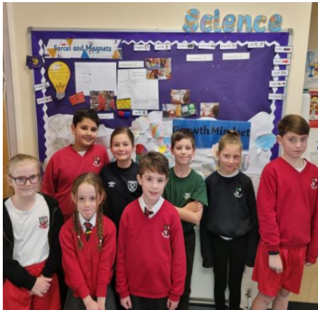
The Willowbrook Scientists

At Willowbrook Primary, we value pupils' voices and we think it is crucial to listen to their views, wishes and opinions. Therefore, I have created a team of scientists who represent their classes and will ensure that their peers' Science suggestions and recommendation are considered. Watch this space for future information.